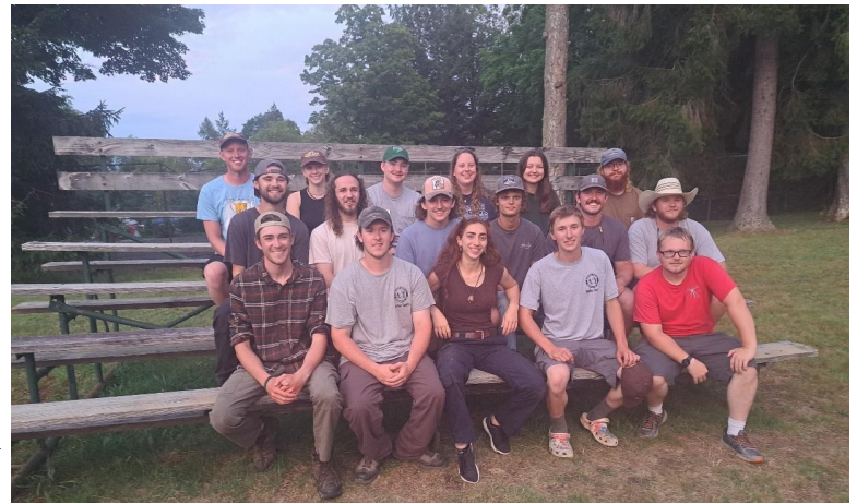
Members of the Class of 2024 in attendance at the Alumni Reunion.

We are in the process of planning our next “Pop-Up Reunion” and it will most likely be scheduled in early Spring 2025. As plans are developed, we will announce the event via e-mail