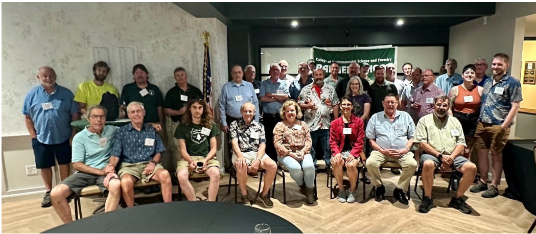
RS Alumni attending “Pop-Up Reunion” at Batavia Downs Casino & Hotel in June 2024.