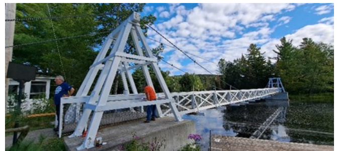
Sept 2024 – First coat almost done

Unfortunately, it was difficult to start priming the bridge as there never were 3 days in a row of dry sunny weather to apply the primer. In mid-August,