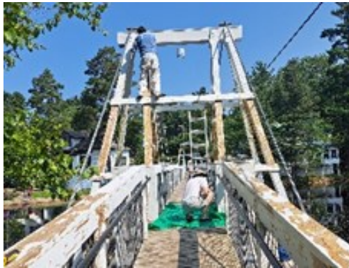
Scraping the bridge

The WHA is near completing the repainting of our footbridge. Last year Ranger School Alumni and WHA Trustee Beth Daut stepped up to coordinate the scraping and repainting of the peeling paint on the footbridge. FYI: one of the major grants received to rebuild required it to look like the original that was destroyed in the ice jam., Over 20 volunteers stepped-up to scrape the