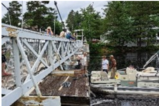
Barge to catch scrapings

volunteers were finally able to complete the priming over several weeks and the application of two coats of solid stain is almost complete at this writing. A representative of Sherwin Williams reviewed the project and recommended the products to be used. In addition, Sherwin Williams gave us a significant discount on the cost of the primer and solid stain. This is a true community effort that is bringing this project to fruition.